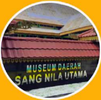
Museum Sang Nila