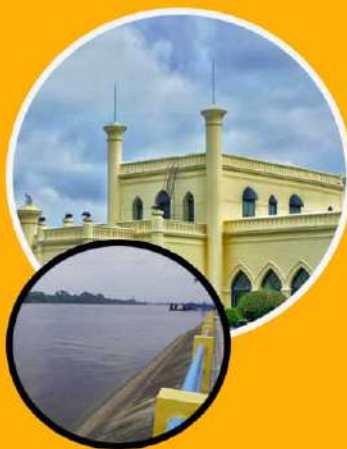
Istana Siak Sri Indrapura