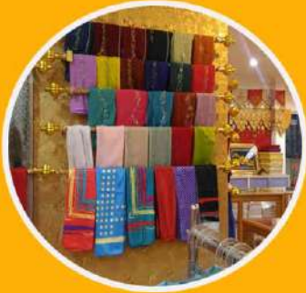
Pusat Seni Silungkang