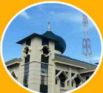
Masjid Al-Falah Darul Muttaqin