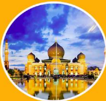
Masjid An Nur