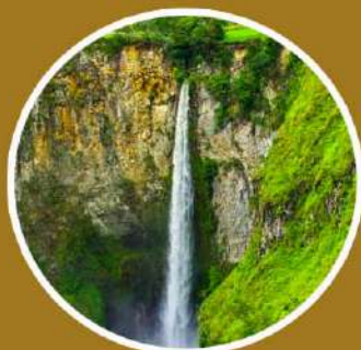
Si Piso Piso

The Sipiso-piso is a plunge waterfall in the Batak highlands of Sumatra, Indonesia. It is formed by a small underground river of the Karo plateau that falls from a cave in the side of caldera of Lake Toba, some 120 metres down to lake level.