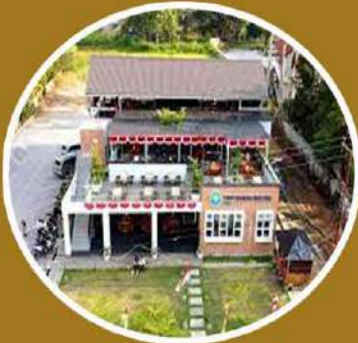
Tepi Danau Bistro