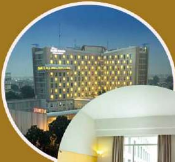
Option 1 SANTIKA Dyandra 4 Star Hotel