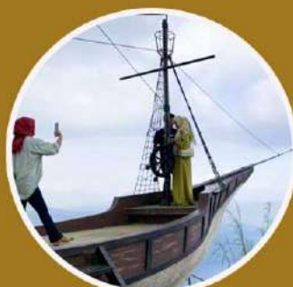
One Tree Hil Simalem Resort

If you go to Lake Toba, your visit won't be complete unless you also visit the Tele Viewing Tower. This tower is a popular tourist attraction because it offers a stunning panoramic view of Lake Toba. Visitors can see the entire lake from the tower, making it a must-see destination for tourists.