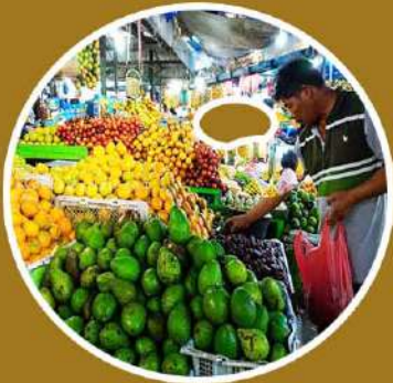
Brastagi Fruit Market