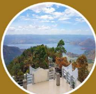
Menara Tele Danau Toba

N9OT will adjust tour based the places of interest selected by the customer and advise based on time limits and ground conditions.