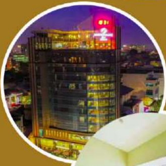
Option 1 Hermes Palace Medan 4 Star