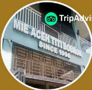
Mie ACEH TITI Bobrok