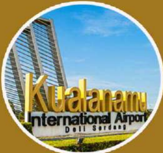
Kualanamu International Airport