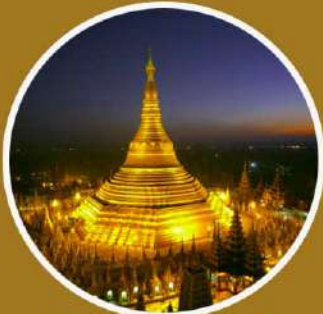
Replica Pagoda Swedagon

A visit to Lumbini Natural Park, which is often referred to as the Pagoda by the people of Medan is a must. This location is perfect for those who enjoy taking selfies and is one of the Buddhist places of worship.