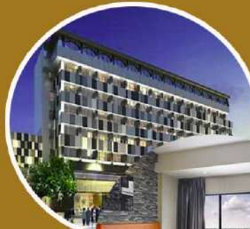
Option 1 Le Polonia Medan 4 Star