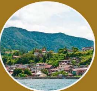
Port of Three Kings PARAPAT