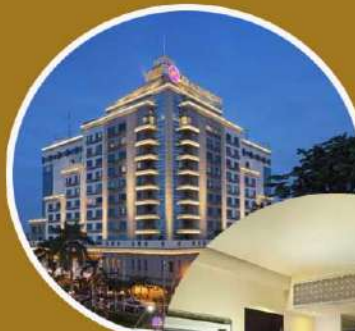
Option 1 Grand Mecure Medan 5 Star