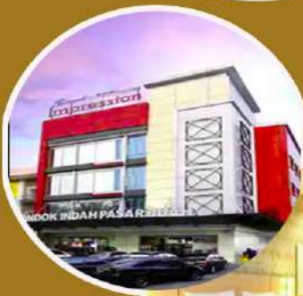
Option 2 Grand Impression Medan 3 Star