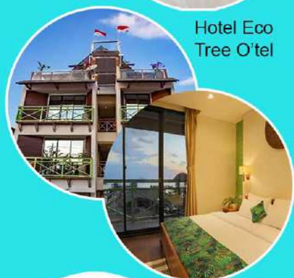
Hotel Eco Tree O'tel