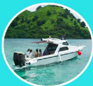
Speed Boat Deluxe