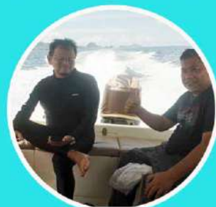
Upto 12 Pax