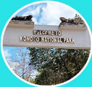
Komodo National Park