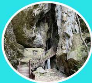
Batu Cermin Cave

Batu Cermin, also known as Mirror Rock, is a tunnel or cave located in the dark stone hills of Labuan Bajo, West Manggarai, Flores, East Nusa Tenggara. Sunlight enters the tunnel through a hole and reflects off the stone walls, creating the appearance of a mirror. This is why the site is called Mirror Rock.