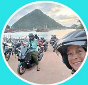
Rent a Scooter

Want to view a stunning sunset with a scenic backdrop of the hilly terrain? Rent a scooter and explore Labuan Bajo at will. Try hiking up Bukit Cinta or Amelia Hill. You'll glimpse the lush greenery all around, absorbing the fresh atmosphere and Mother Nature of Labuan Bajo.