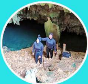
Rangko Cave Pool

According to locals, the best time to visit the cave is at noon. The sun rays will be naturally illuminate the cave. A favourite amongst visitors to Labuan Bajo.