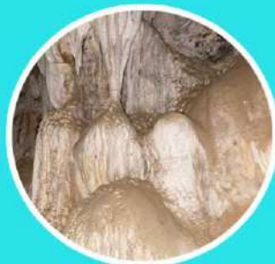
Inside Batu Cermin Cave

The cave is situated about four kilometers east of Labuan Bajo harbor, away from the town center. It is surrounded by forests where visitors can spot long-tailed monkeys and wild boar.