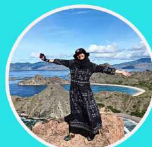
Pulau Padar Peak