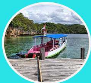
Boat Ride to Rangko Cave

Rangko Cave is a hidden gem, located on the edge of a rocky beach that can be reached by land and then by a fisherman's boat or a ship from Labuan Bajo. The beauty of this cave is not visible from the outside, we have to climb a bit for about 5 minutes from the beach, and we'll see a hole with stone stairs leading down to the cave with blue water like a small lake with stalactites, creating a stunning view. We can swim in the cold water of the pool, lined with stalactites.