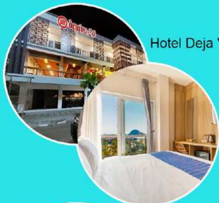
Hotel Deja Vu 2.0