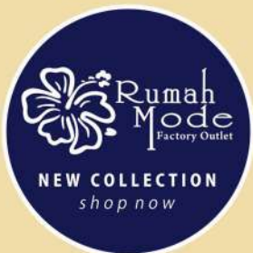
Rumah Mode Factory Outlet