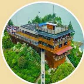
Glamping Lakeside Boat Resto

We move on to Glamping Lakeside Rancabali and pay a visit to the Pinisi Resto stands majestically on the edge of Situ Patenggang. This place has become very popular because it is designed to resemble a Pinisi boat. Pinisi Resto also serves as the main attraction for tourists who come to the Glamping Lakeside complex.