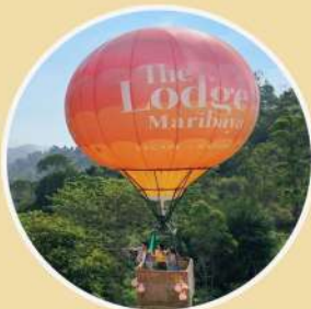
De' Lodge Maribaya

Jakarta is the main economic, cultural, and political hub of Indonesia. It is considered as a province itself and is home to approximately 11.4 million people as of 2024. Despite its small area of only 661.23 square kilometers, it has a much larger metropolitan area spanning 9,957.08 square kilometers, which includes surrounding cities like Bogor, Depok, Tangerang, South Tangerang, and Bekasi.