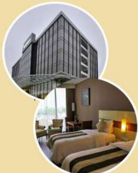
Hotel California Bandung