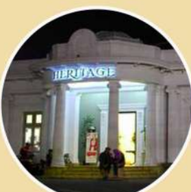
Factory Heritage Outlet

Day 4 starts with breakfast at the hotel and participants will be taken shopping. Bandung is not Paris but when it comes to fashion, the capital of West Java has plenty to offer. From a leather craft center to an old market dated as far as the early 19th century, Bandung is Indonesia's second fashion capital after Jakarta.