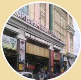
ITC Pasar Baru