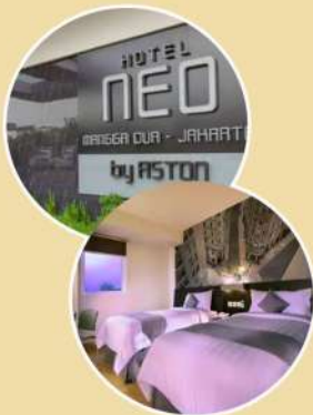
Neo Aston Jakarta