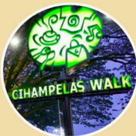
Glamping Lakeside Boat Resto