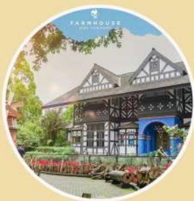
Farm House Lembang