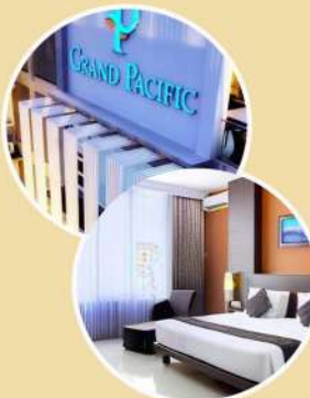
Grand Pacific Bandunf

Accommodation is on a twin sharing basis. Single occupancy rates will be given on demand.